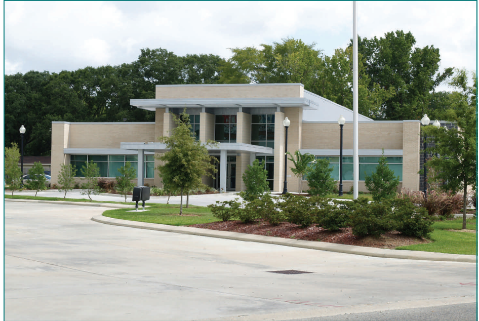
Building Design by Remson-Haley-Herpin Architects